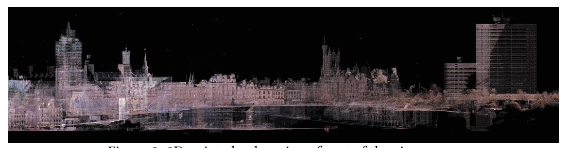
Figure 3: 3D point cloud section of part of the city centre (underground tunnels are visible).

These positions were depended on the TSL equipment accuracy and in this case it involved consequent scanning positions with a distance of less than 40 meters. Furthermore and due to the complex and hilly topography of Aberdeen, further positions were necessary to capture the different levels complexity, as presented in Fig.3. The TLS system was also recording HDR photogrammetry data that were overlaid on top of the point clouds, thus providing real-life imaging.