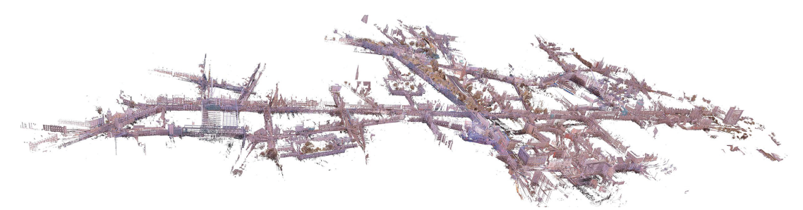
Figure 2: Aberdeen City Centre as-built point cloud.

The 3D data acquisition took place with TLS, for the purposes of the specific project as described in Section 2.2. The map in Fig.2 showcases the extend of the scanning work. 90 terrestrial positions were required on the road level and 10 positions on a higher level, from the top of landmark buildings scattered within the city centre, a process that required two to three months of data collection.