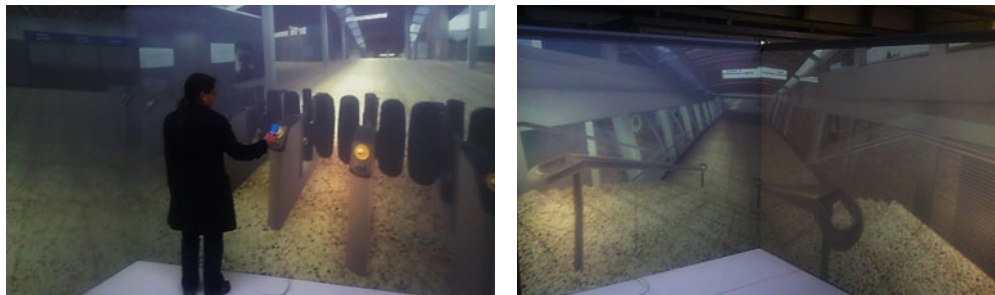
a) User testing visualization scale through simulated interaction

To ensure that time of assembly to operation adhered to requirements, the construction of the solution was timed on three occasions using different personnel. The fastest time recorded was 32 minutes with an average of 41 minutes for two users to assemble and calibrate the facility ready for use. To ensure calibration of the screens and user interface, non-technical users was asked to find visual defects in the immersive environment, (Figure 2), noting their experience and sense of immersion. The current prototype does not contain head-tracking, so users noticed a warped visual display if they stood significantly off the projection axis, but most users found their experience was not drastically affected.