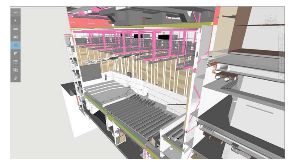
Figure 1. Federated model files used to find areas of 'clash' within proposed design scheme (Draper, 2015).

and beyond the bounds of the supply team, i.e. outwardly to the University community. Weekly meetings gathered the representatives of each core stakeholder group to review the design. The participants used the model to discuss and refine specific design elements, check for 'clash detection', or simulate specific operational activities. An extranet system was created to facilitate a 'Common Data Environment', allowing easy access to the same raw modelling data for all parties. Although the idea of a common data environment is not new (British Standard Institute, 2007), a single coordinated location for the project information meant structuring the data in such a manner that allowed objects and associated classifications to be more easily itemized. Single discipline model files were issued and uploaded to the extranet prior to the weekly review meetings so that they may be coordinated, and the clash analysis could be prepared, ready for discussion.