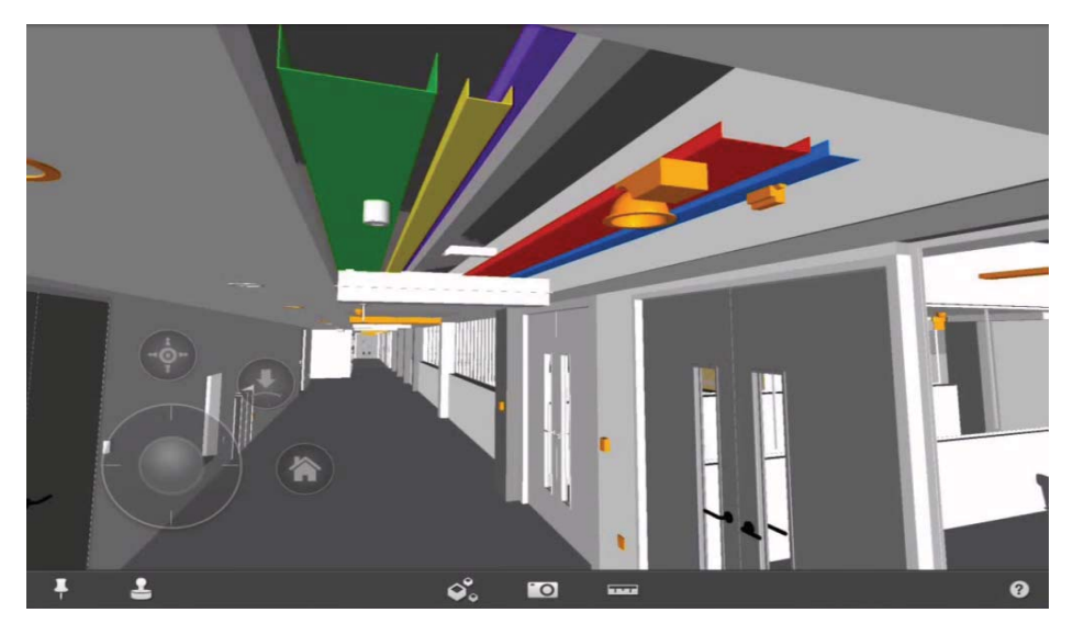
Figure 2. Model view of wiring cable trays captured and coordinated (as-built conditions) (Hall, 2015).

To maintain the accuracy of the collated record data for use post-handover, the University introduced a requirement to take photographs to capture the conditions above ceiling tiles and below flooring constructs (figure 2). Subsequent referencing of these photographic files within the model created a simplistic approach to detailing the unknown, without overloading the level of detail of the model; i.e. technicians within the facilities team now have the ability to discern what lies above and below fixed construction units, and analyze the service-maintenance process, without having to physically come to the site.