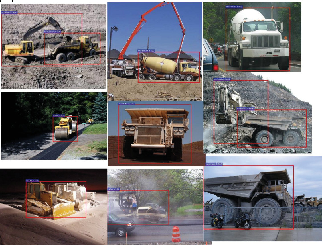
Figure 2: Samples of the detection result

Future studies are required to complete a truly universal detector of construction objects. This study is, to our knowledge, the first attempt to propose a deep CNN in the construction object detection. The deep CNN used is in our study is even the state-of-theart in the computer vision community. However, the dataset we used is still limited in the sense that the total number of images used is 2,920. Increase of the dataset and the number of construction object classes would result in more validation and verification of the proposed method for the construction industry.