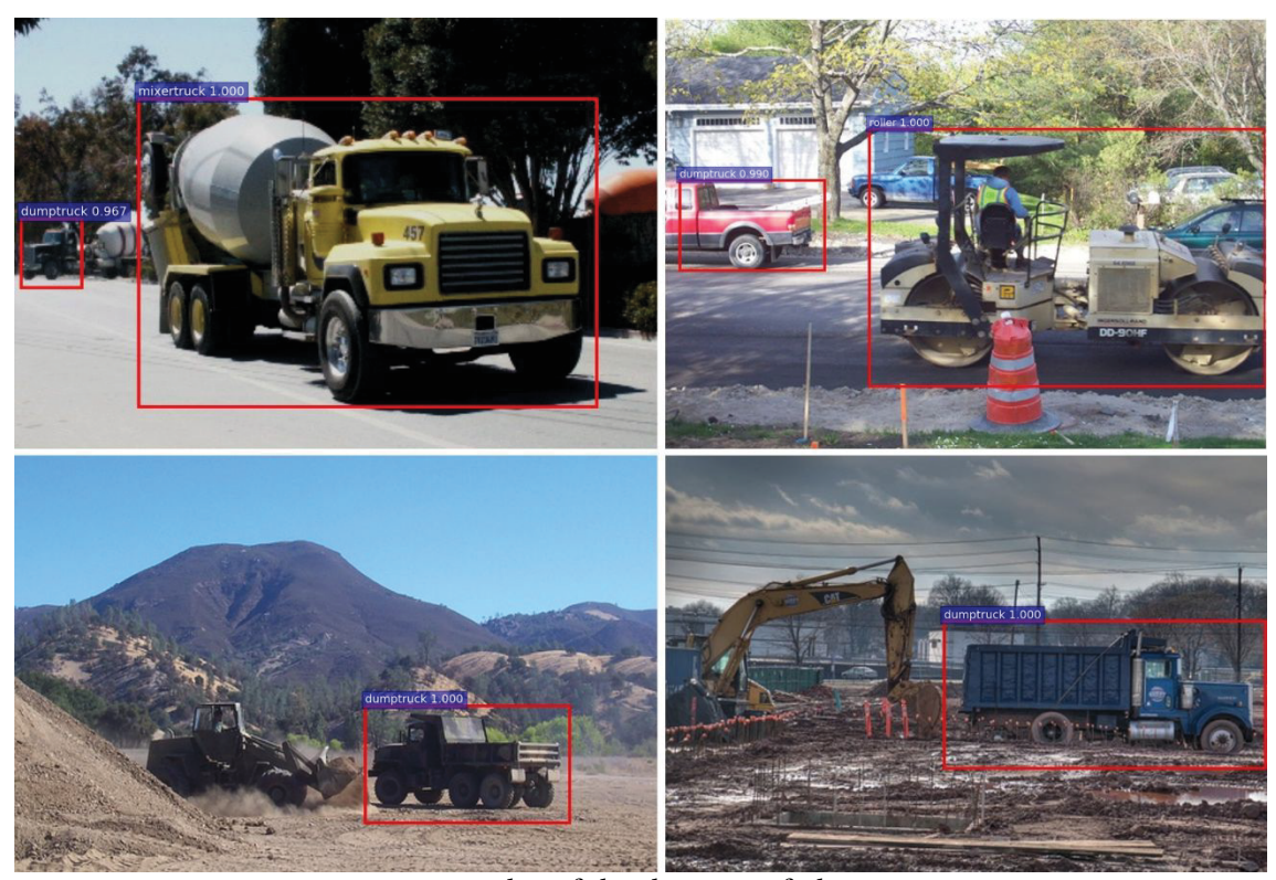
Figure 3: Samples of the detection failures