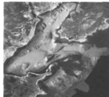
View of Louisburg Harbour. Bedford Institute, 1998

As described earlier GIS acts as a neutral mechanism, specifically to distance the eye from the subject. What is unique about this protocol is that it has the ability to spatialize things that up until this point were entirely invisible either for reasons of scale or discreteness. Any space has a multitude of topographies hidden and coinciding with the lived and real space. Space can be objectified and sculpted by selecting filters that construct a