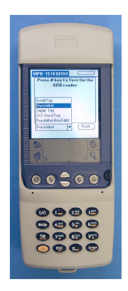
Figure 3 RFID Hand-held reader (www.rf-id.com)