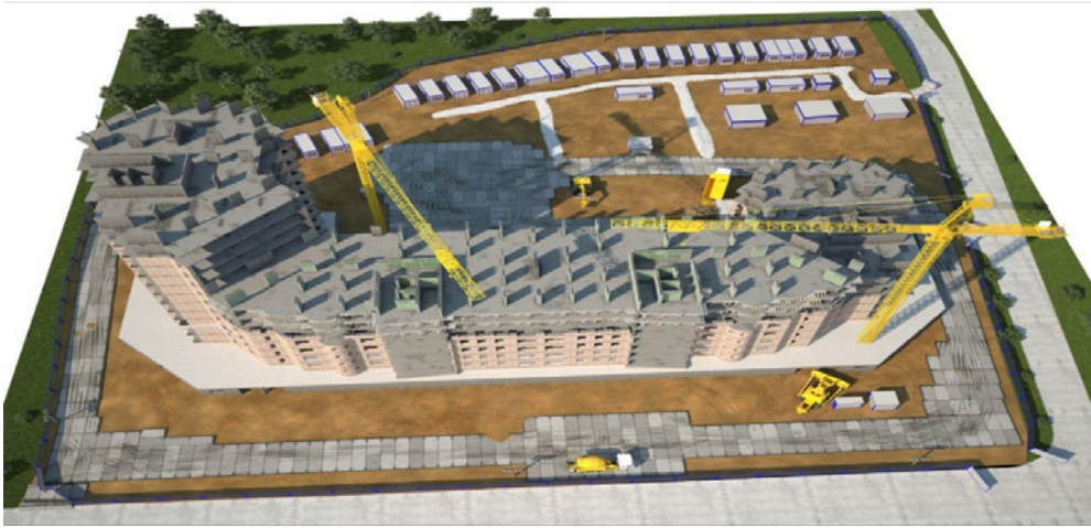
Figure 1. Virtual model of building master plan

Partial translation of basic vector graphics is the most commonly used way of 3D modeling nowadays. The principle is that any of 3D models (from which virtual space consists of) is presented as some number of intersected surfaces. As a result we have 2D polygons which are placed in 3D coordinate system.