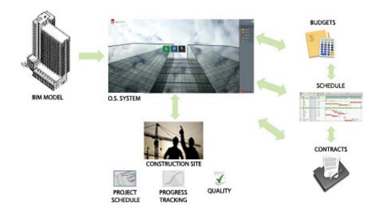
Figure 4 O.S. System automating the connection between subsystems