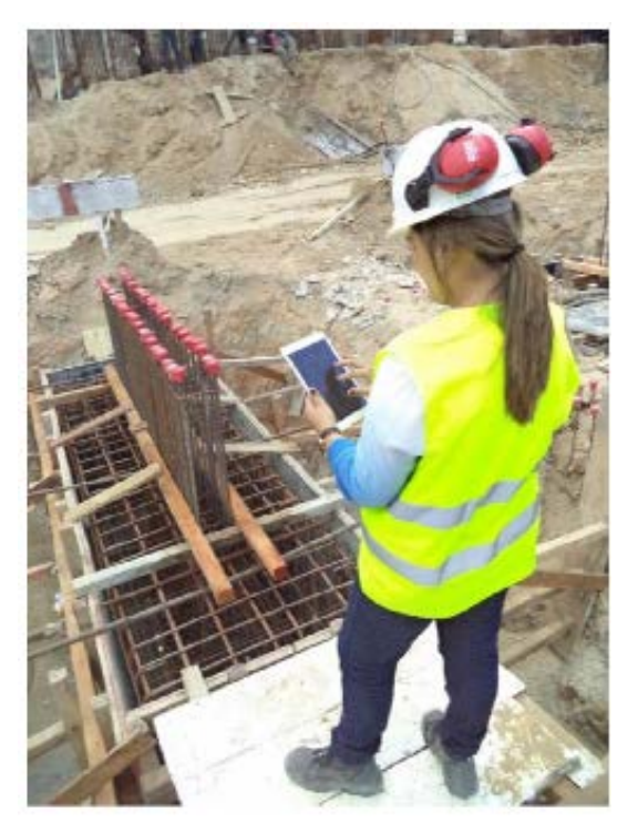
Figure 5 Mobile technology for on-site operation