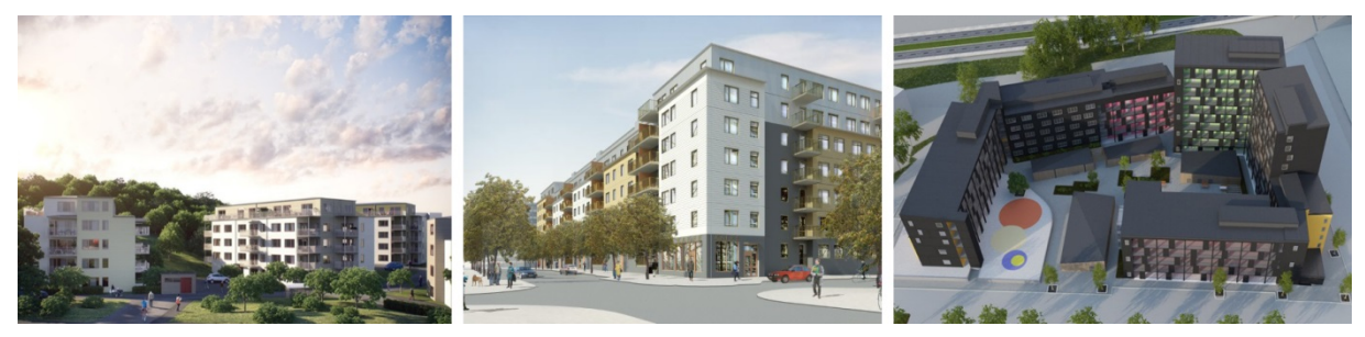
Figure 2 Three projects from the case company where they have used their building system.

locations, e.g. how multiple buildings and floors are planned, was investigated by looking at the Location Breakdown Structure (LBS).