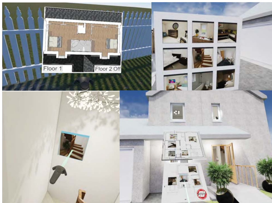
Figure 3: Floor Plan Visualisation. Left to Right: Floor Plan Attached to Left Controller; Reusable Teleport Buttons System; Aligned Floor plan.