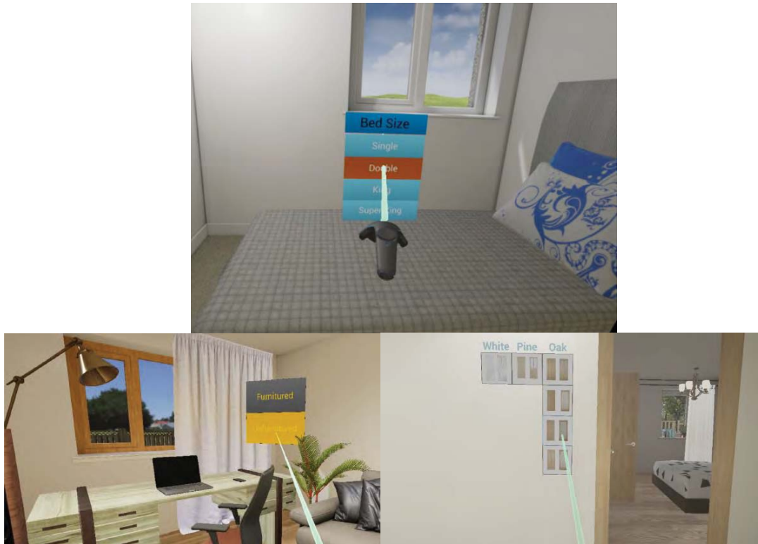
Figure 4: Visualising Room Sizes. Left to Right: Choosing Furniture Size; Choosing Interior; Changing Door styles.