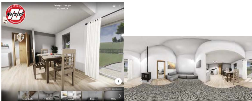
Figure 2: 360 Architectural Scenes Demonstration for Web and Mobile Platforms. From Left to Right: (1) Lounge Demonstration, (2) Unwrapped 360 image of the same room

The first point of a company communication with a client is characterised with building the rapport, establishing company credibility and familiarisation with the multitude of the product range. Therefore for the clients, who just considering the self-build option, are recommended to use a lighter version of the VR experience. 360 images and videos, WebVR experiences are now fairly easy to be accessed through brand mobile apps and company websites. HTML frameworks like A-Frame and Roundme provide easy deployment of Interactive WebVR experiences on any website. Branded cardboard headsets could be posted to a client location for further encouragement. The 360 scenes with gaze interaction interface enabling the transition from one image to another are sufficient to fulfil the first point of contact communication stage with the client: high fidelity spatial perception demonstration, reputation building, quick access to a multitude of the product demo scenes. At the current level of hardware and software capability, lightweight 360 scenes have proven to be more efficient, compare to heavyweight 3D scenes, which would need to incur significant optimisation or loss of the level of the detail and visual quality to be adapted for WebVR.