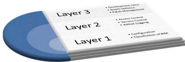
Figure 2: Proposed security model Collaborative building design